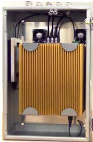
Industrial pc in protective case