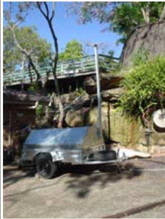
Custom Built Trailer Mounted Unit