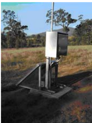
Example of a remote field unit set up incorporating industrial pc, solar panel and battery