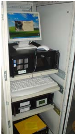
BarnOwl ® Version 3 running on original Bruel & Kjaer based Rack Mounted Unit