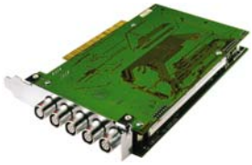
Sinus Harmonie-PCI fits any PC as rack mount solution or slots into industrial pc